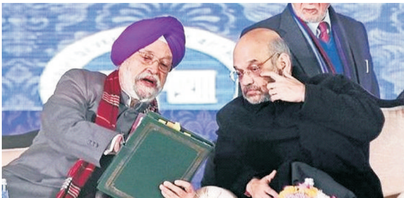
Shri Amit Shah, Hon'ble Union Home and Cooperation Minister and Shri Hardip S Puri, Hon'ble Union Minister of Petroleum & Natural Gas and Minister of Housing & Urban Affairs.